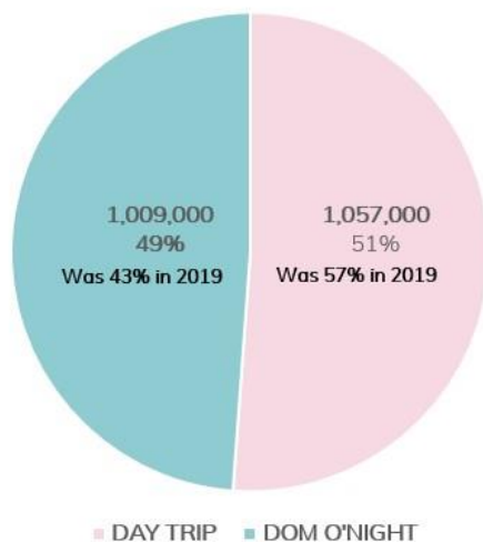
DOMESTIC VISITORS TO NOOSA YE June 2022: Total = 2,066,000